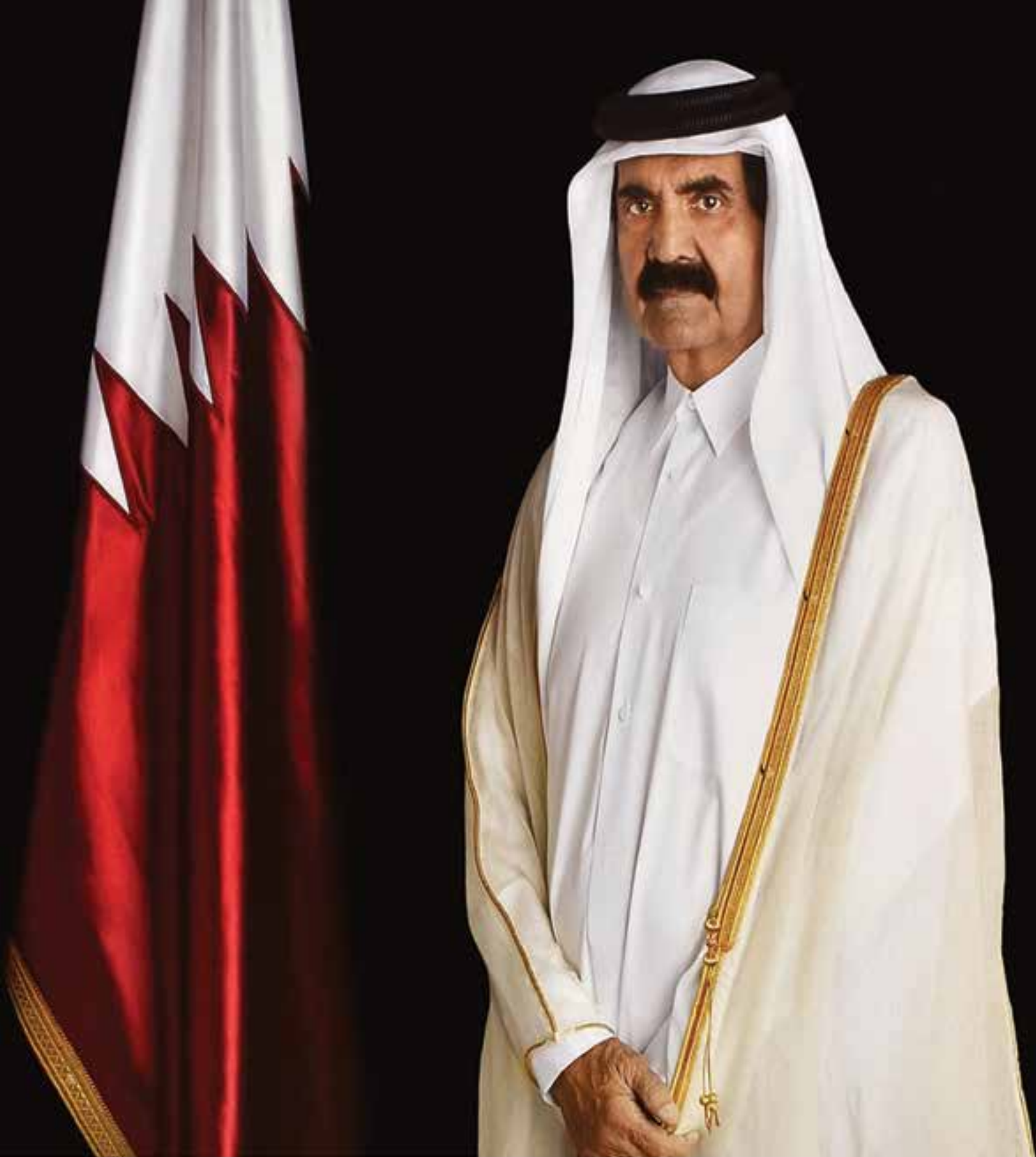
صاحب السمو الأمير الوالد الشيخ حمد بن خليفة آل ثاني

H.H. THE FATHER AMIR SHEIKH HAMAD BIN KHALIFA AL-THANI