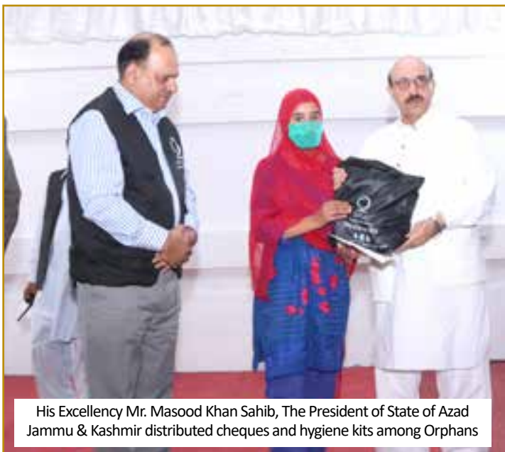
His Excellency Mr. Masood Khan Sahib, The President of State of Azad Jammu & Kashmir distributed cheques and hygiene kits among Orphans

Besides extending financial assistance, Qatar Charity engages its registered beneficiaries, specially orphan children, in calendar activities every year i.e. National Sports Day, World Orphans Day, Health-screening and Diagnosis Camp, Global Hand Washing Day, Ramazan Food Package, Zakat ul Fitar, Eid Gifts, Winter Support and Qurbani Program.