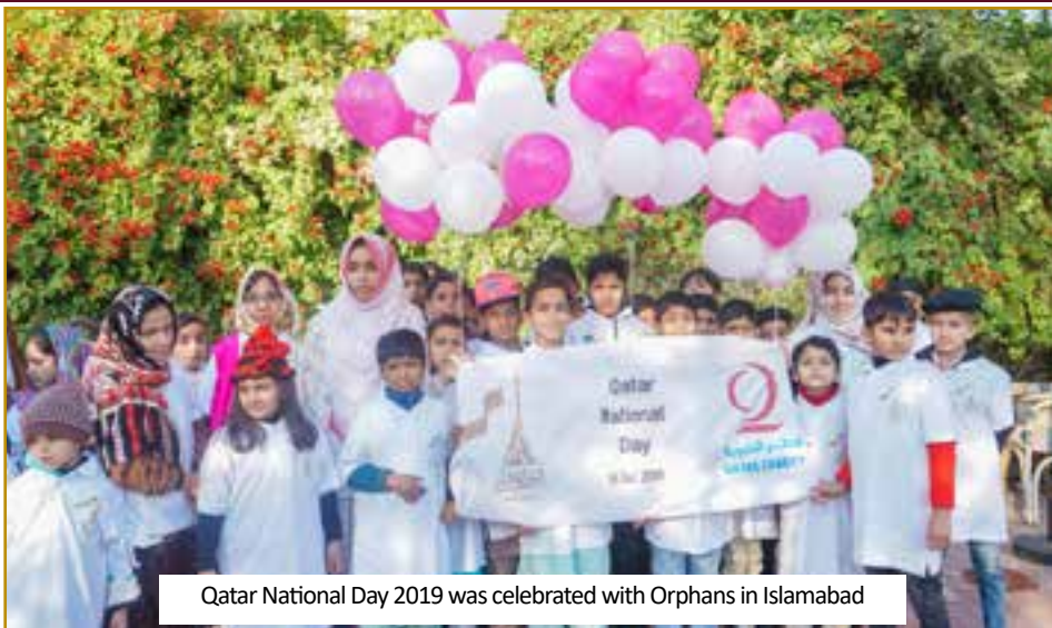
Qatar National Day 2019 was celebrated with Orphans in Islamabad