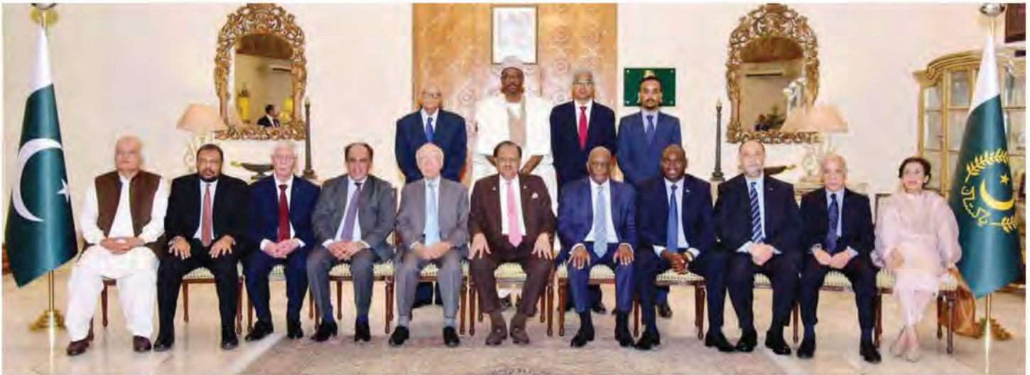
President Mamnoon Hussain in a meeting with Ambassadors/High Commissioners of African Countries at Aiwan-e-Sadr, Islamabad.