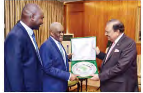
Mr. Mpendulo Jele, High Commissioner of South Africa (Dean for Africa) presenting a Shield to President Mamnoon Hussain after a meeting with Ambassador/ High Commissioners of African Countries at Aiwan-e-Sadr, Islamabad.

The President emphasized that Africa has a special place in Pakistan's foreign policy adding that Pakistan has adopted 'Look Africa Policy' to further strengthen relations with African countries. The basic objective of this policy is to further expand cooperation in political, educational, cultural and economic fields so that the trade volume between Pakistan and African countries can be further increased. African countries must prepare themselves to benefit from CPEC.