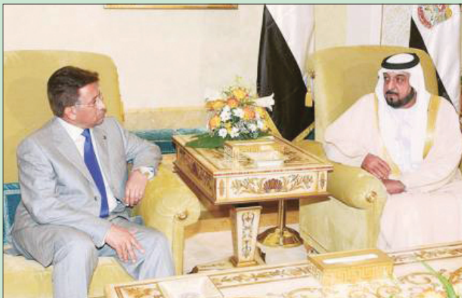
President of the UAE and H.H. Sheikh Mohammed bin Rashid al Maktoum, Vice-President, Prime Minister and Ruler of Dubai.

Both countries reaffirm their strong commitment to further reinforce the bonds of friendship. They urge the need to expand the horizon of their bilateral cooperation in diverse fields reflecting deep-rooted and historic ties.